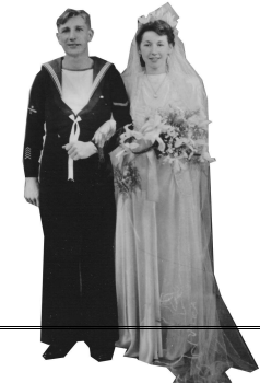
Married 11 June 1945, St Giles, Royal Mile, Edinburgh